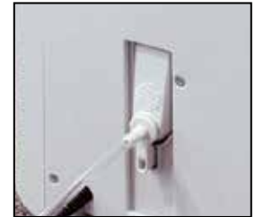
Built-in drain pump in models D50BP and D70BP.