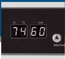
Displays room temperature and humidity %.